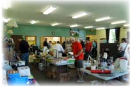
The annual Garage Sale at Christ Church Cathedral, 28 Jun 2014.