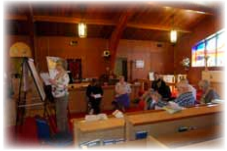
Vestry Retreat at the Cathedral – planning & brainstorming session, 3 May 2014.