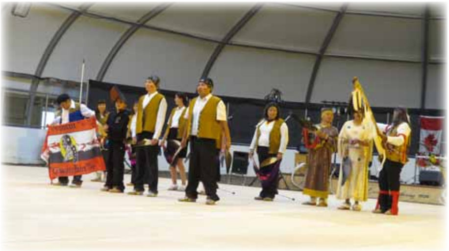
The Vuntut Gwich'in Dancers perform at the ceremony.