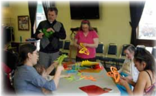
Messy Church, Yukon Style – craft session in Hellaby Hall, 13 Apr 2014.

An early parish work bee also helped improve the general appearance of the Gardens. With one of the best lawns in town, with Christ Church Cathedral and the Old Log Church and Rectory as the prime setting, it is a serene center of Whitehorse.