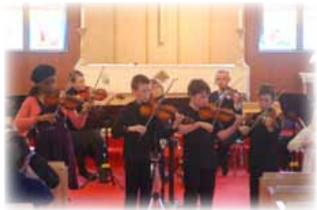
Whitehorse Strings Ensemble spring concert in Christ Church Cathedral, 27 Apr 2014.