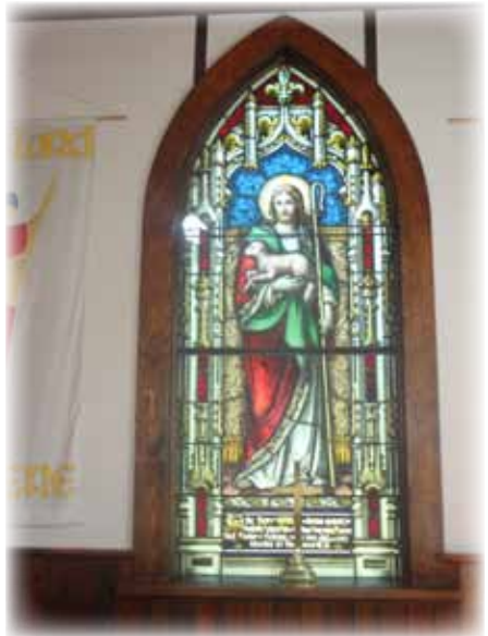
Photos: clockwise from top left: * Saint Savior's in Carcross * Welcome to Carcross * part of the new Carcross Commons * Strained glass window * Canon David Pritchard