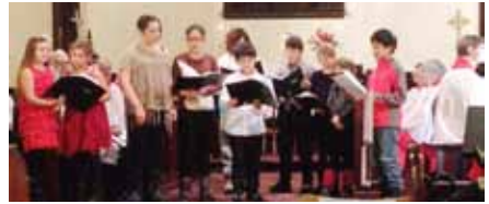
The Youth Choir meets weekly and leads the singing in church several times a year, though most of its members do not attend St. Paul's regularly.