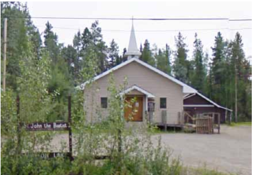
St. John's as seen from Google Street View.