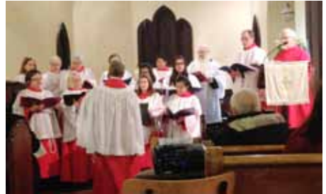
The adult choir is also ecumenical and currently assembles for about six weeks before Christmas.