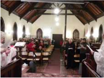
St. Paul's is the largest of the church buildings in Dawson and so is the natural place to hold the ecumenical Christmas Eve Service and Nativity Slide Show Pageant. The empty chairs are where the choir sits to be able to see the slide show.