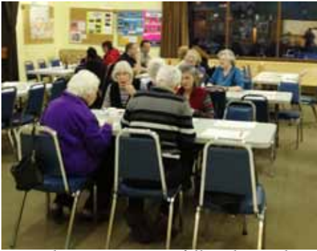
Parishioners enjoying fellowship and the pancakes in Hellaby Hall.