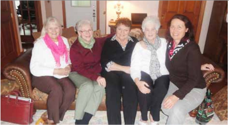
This is my Sacred Threads Prayer Group back home in Ontario. You should never leave home without one.