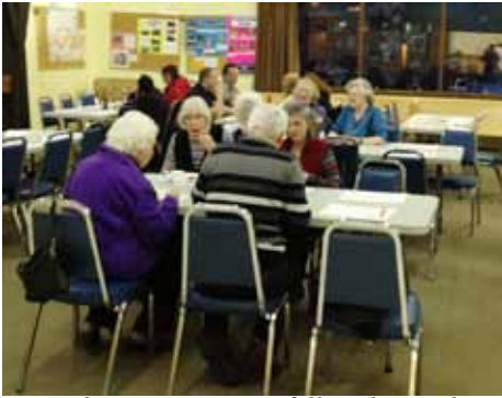
Parishioners enjoying fellowship and the pancakes in Hellaby Hall.