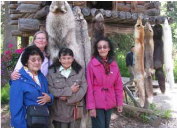
This is my prayer group in Haines Junction on summer vacation in Fairbanks.