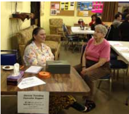
It's great to have people willing to volunteer as cashiers!