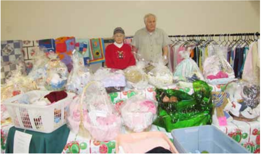
A photo of our Craft Fair booth. for November 29/14 Watson Lake