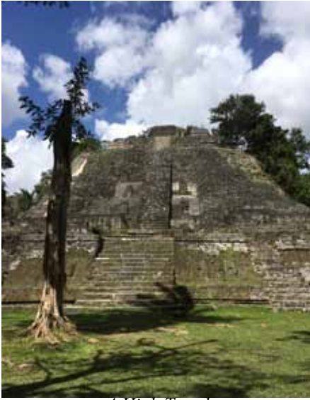
A High Temple.