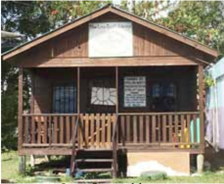
Lina Quinta library