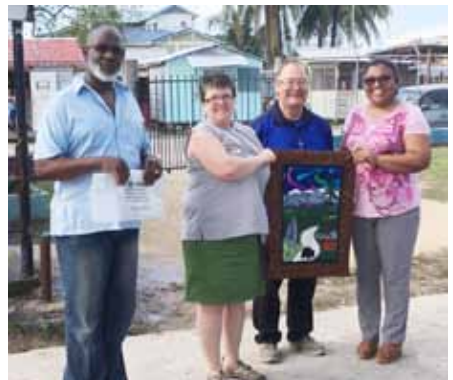
Donations from St Mary Magdalene