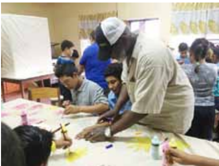
Creating an altar cloth.