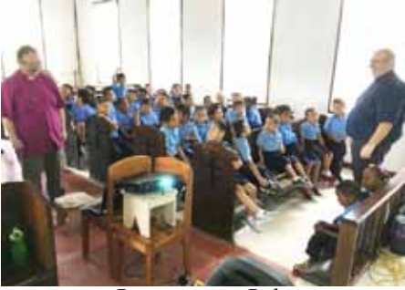
Beginning in Belize