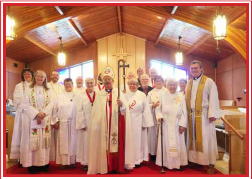
Clergy and delegates assembled during the Service at the Diocesan Synod.