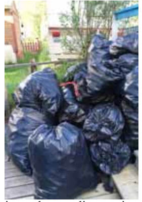
The recycling crew was busy raising funds for chapel repairs and upgrading again this past summer. The raised $3800.00.