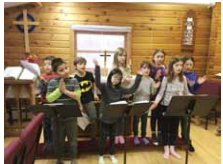
St. Paul's Youth Singing Group.