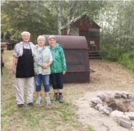
St. Paul's helped out during the Moosehide Gathering