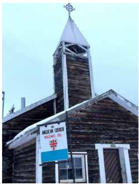
This is the "old" St Luke's, which will hopefully be repaired soon. This was built in 1959.

This is the newest St Luke's, new and with lots of room.