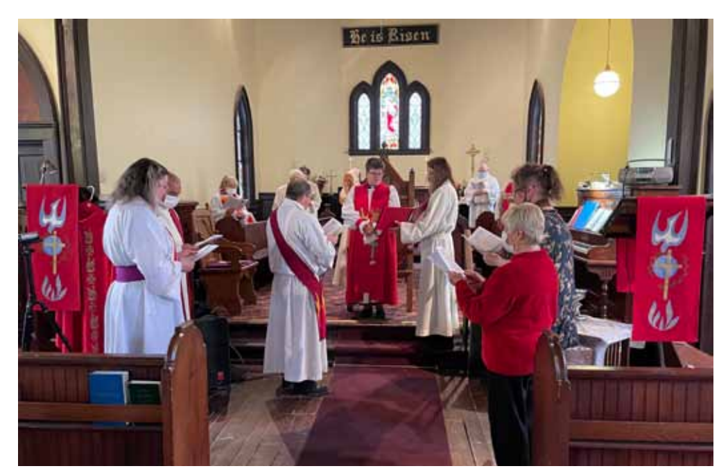
The postulant is presented to the Bishop at St. Paul's.