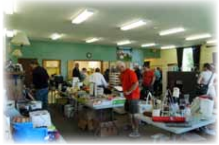
The annual Garage Sale at Christ Church Cathedral, 28 Jun 2014.