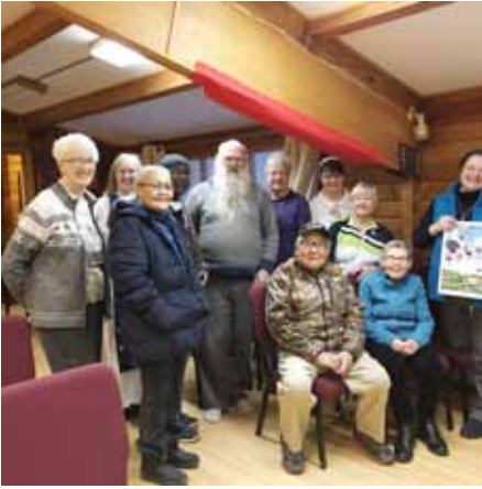
Raising money for PWRDF Buying the Farm through World of Gifts - Tanzania, Mozambique and Burundi