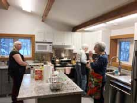
Cooking for our Shrove Tuesday Pancake supper in the Richard Martin Chapel's NEW KITCHEN.