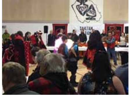
Members of the community and the Expedition team members watch the Tahltan drummers and dancers.